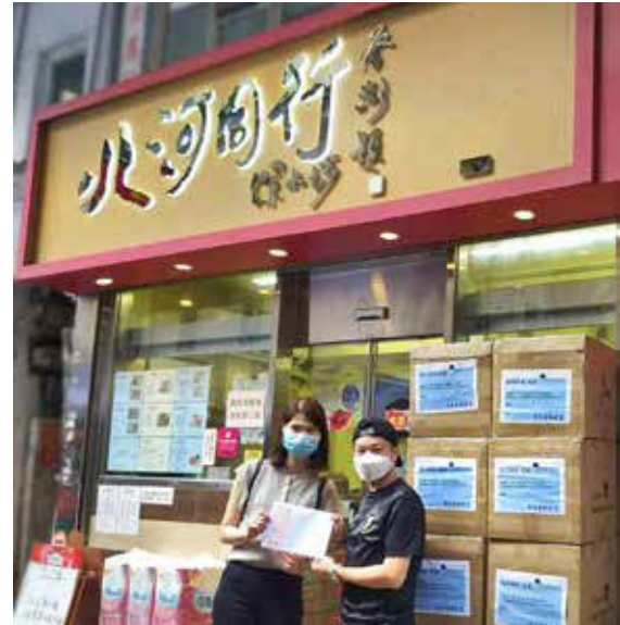
Pei Ho Counterparts