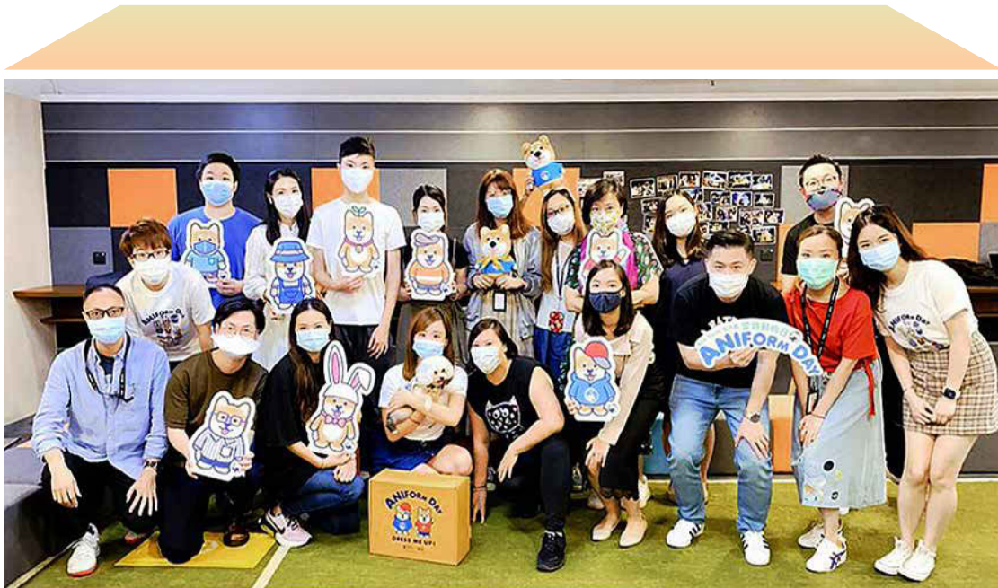
SPCA Aniform Day

In recognition of our continuous efforts, we have been awarded with the Caring Company Logo from the Hong Kong Council of Social Service for twelve consecutive years.