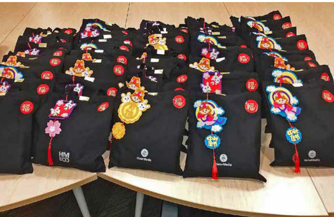
HM gift bag to Po Leung Kuk Elderly House on Mid-Autumn Festival