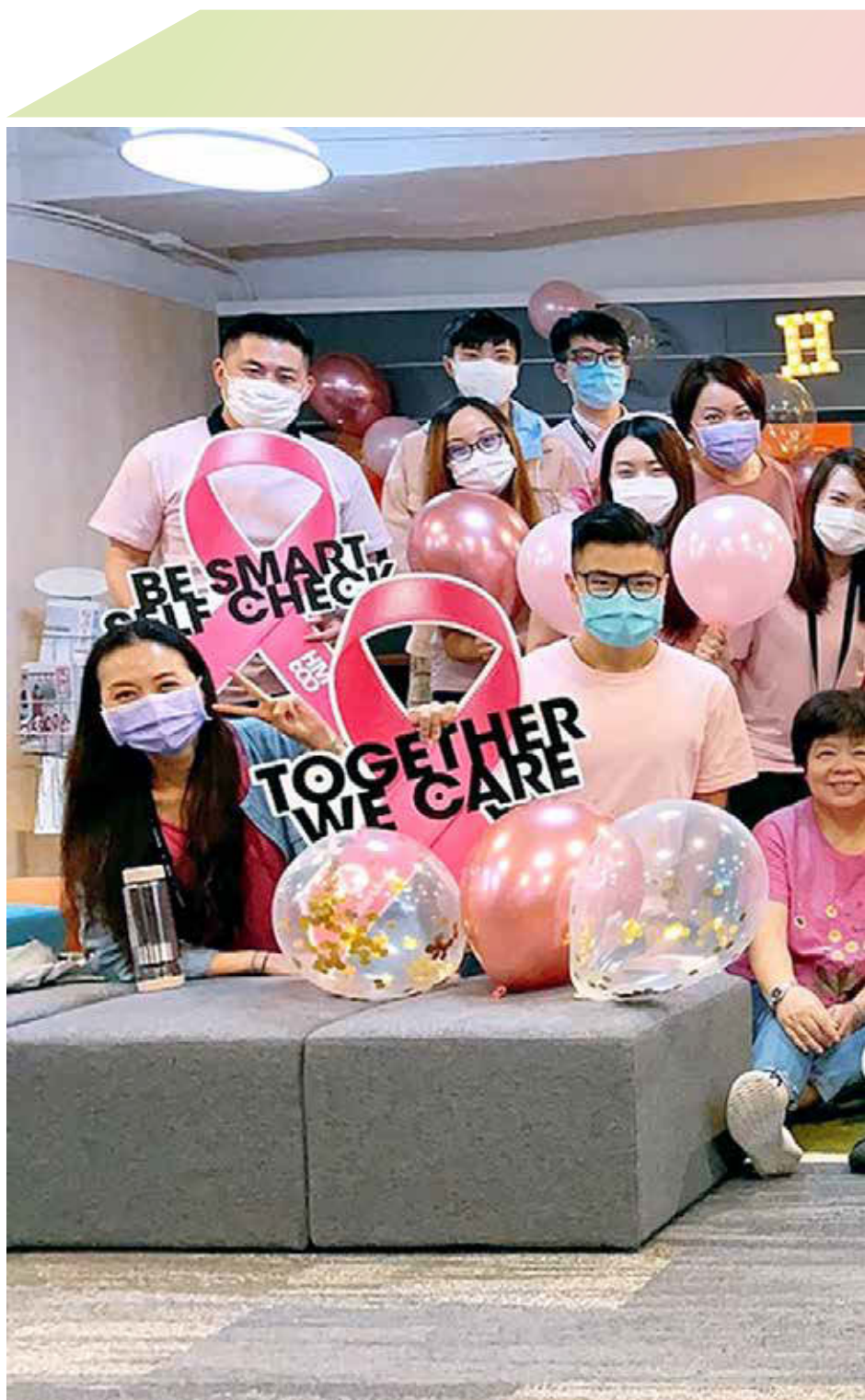
Dress Pink Day to support Hong Kong Cancer Fund

The Group's SRT was established in 2007, and ever since we have been taking part in various charity events, projects and donation drives. In 2020, we have recruited 106 volunteers and have contributed some service hours to visiting the elderly and providing interest classes to the community. Due to the restriction of the physical access to the premises requested by most of the associations, there was difficulty to serve our community on-site. We have also directly and indirectly donated around HK$39,410 in support of various charitable activities.